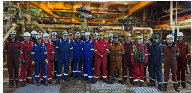
The experienced crew for the P&A campaign

The integration of deck crew scopes of work into the drilling/P&A crew further optimized people on board (POB).