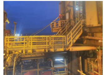
V Door Pipe Ramp Handling – Study, Design, Engineering and Fabrication